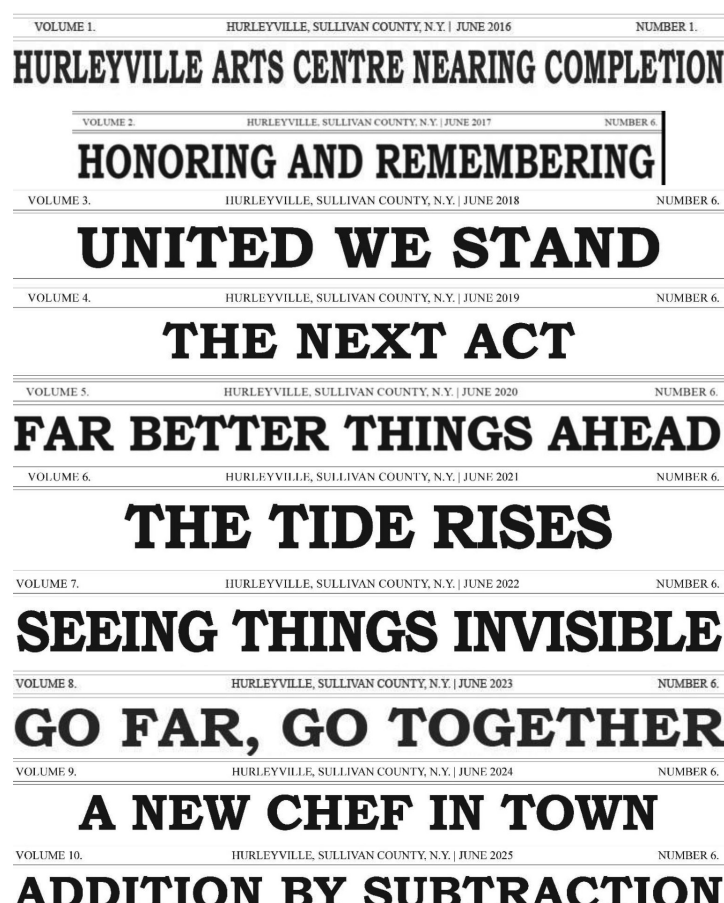
Ten years of intriguing headlines from the June issues of The Hurleyville Sentinel

That's why serialized fiction is still prominent among the newspaper's pages, as well. In the early days, a lot of newspapers did that, but now it's more of a lost art, a throwback that the Sentinel continues. It's a fan favorite